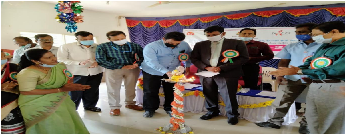
The program was inaugurated by Taluk health officer 15/12/2021 at S K Memorial Hall, Rural College